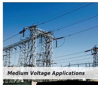
Medium Voltage Applications