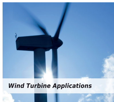
Wind Turbine Applications

All our electronic devices are developed and tested according to current international standards such as the IEC 60255. Production of our products is subject to strict quality processes. This is proven by certification to ISO 9001.