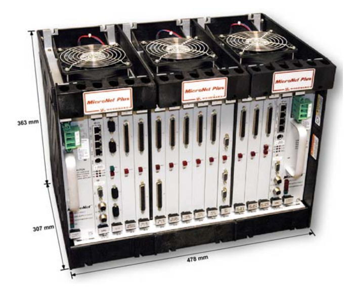
MicroNet Plus Control Chassis (14 VME slot option)

Full-size Chassis 14 VMENarrow Chassis 8 VME