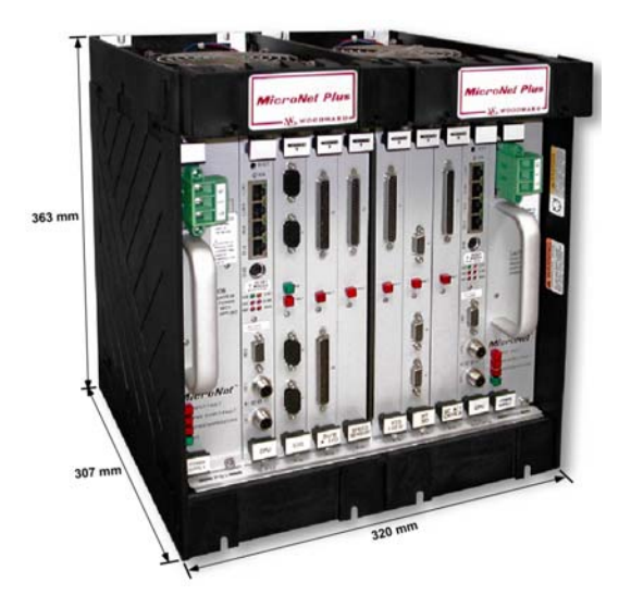
MicroNet Plus Control Chassis (8 VME slot option)

Power supplies may be simplex or redundant in any combination of input voltages.