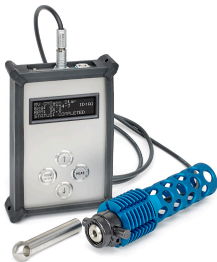
PREMETS® M with Sensor

Balancing the cylinder load helps extend engine life, increases efficiency, and reduces emissions to assist with environmental compliance.