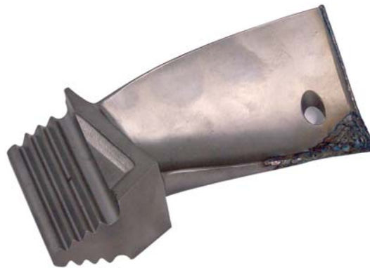
Blade in Process of Repair